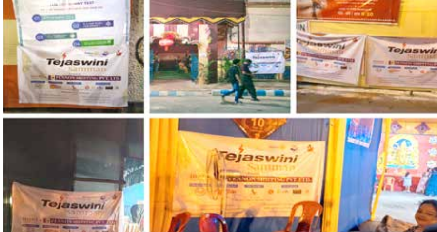
RC Calcutta Avyanna put up these banners during puja days in different areas of Kolkata